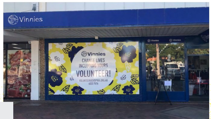
Spot the difference: The Nollamara shop before and after the makeover.