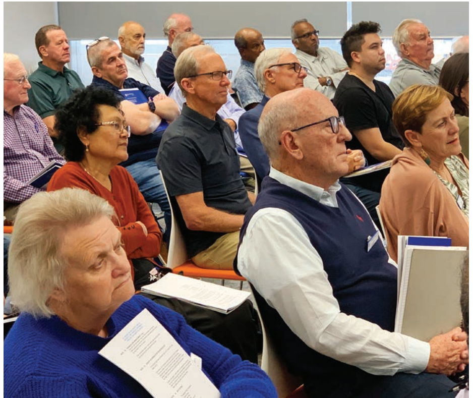
Dozens of Members attended this year's AGM.

The Annual Review is available to download at www.vinnieswa.org.au/about-vinnies-wa/publications/vinnies-publications/