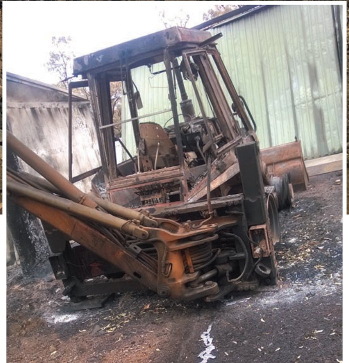
The Perth Hills bushfire destroyed 86 homes.

Another resident lost the rental property she had lived in for 15 years, the beautiful garden she had created lost to the flames.