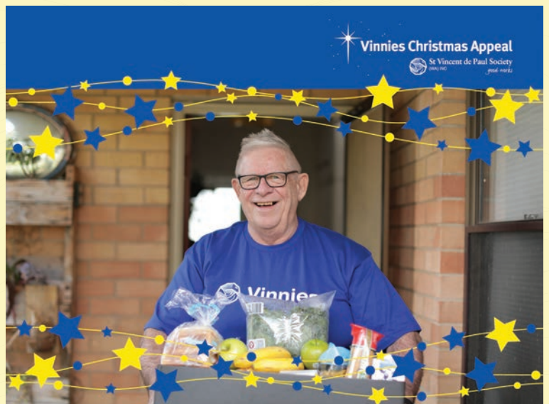
Vinnies Members are stepping up their fundraising efforts.

To donate and help make a positive difference in these people's lives, visit www.vinnieswa.org.au or call 13 18 12 .