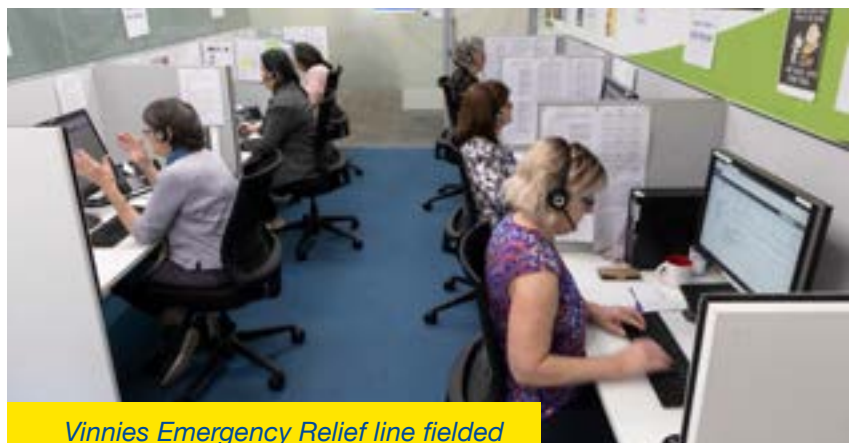
Vinnies Emergency Relief line fielded 4,800 calls in February.

Around 60 per cent of our clients are in housing stress, which means they are spending more than 30 per cent of their disposable income on mortgages or rent. “Any further increases in interest rates will likely lead to further arrears, and place people at risk of losing homes,” he says.