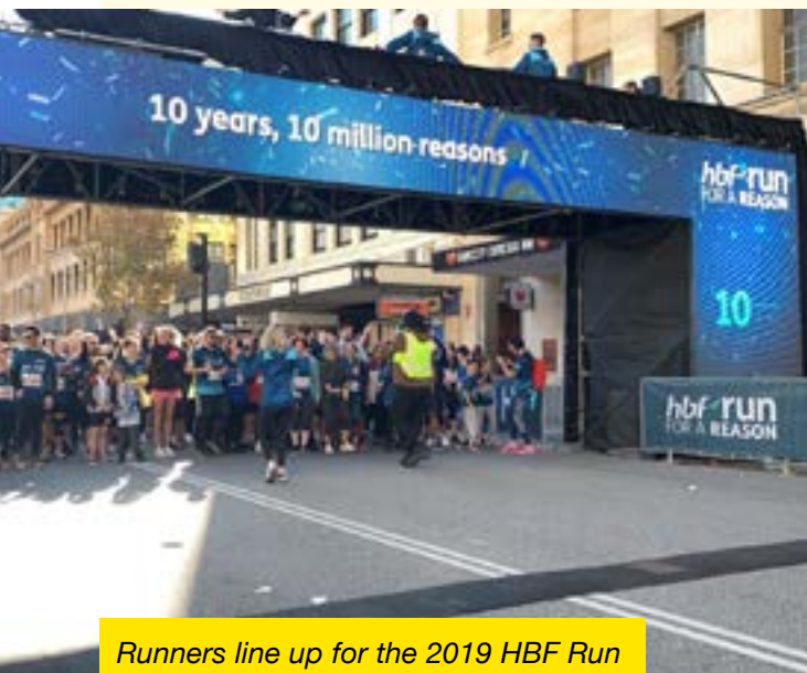
Runners line up for the 2019 HBF Run for a Reason.

Courses include 4km, 12km or a half marathon (21km).