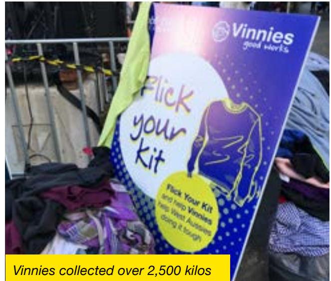
Vinnies collected over 2,500 kilos of clothing in 2019.

At this year's event, Vinnies WA will also be running our Flick Your Kit initiative again to support event participants of the HBF Run for a Reason.